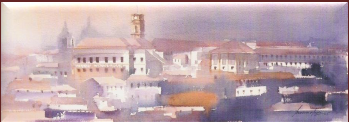
COIMBRA UNIVERSITY AND DOWNTOWN